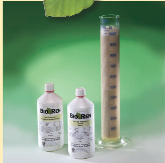
BIOREN® is a registered trademark of Österreichische Laberzeugung Hundsichler GmbH.

All three liquid rennet pastes possess rennet strengths of 1:15,000 Soxhlet and a chymosin content of around 80%. They are available in bottles ranging from 500 to 1000 millilitres and in canisters containing 6 to 12 kilograms.