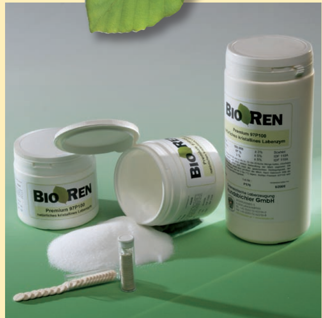
BIOREN® is a registered trademark of Österreichische Laberzeugung Hundsichler GmbH.

Natural rennet is profitable because it delivers the highest possible cheese yields.